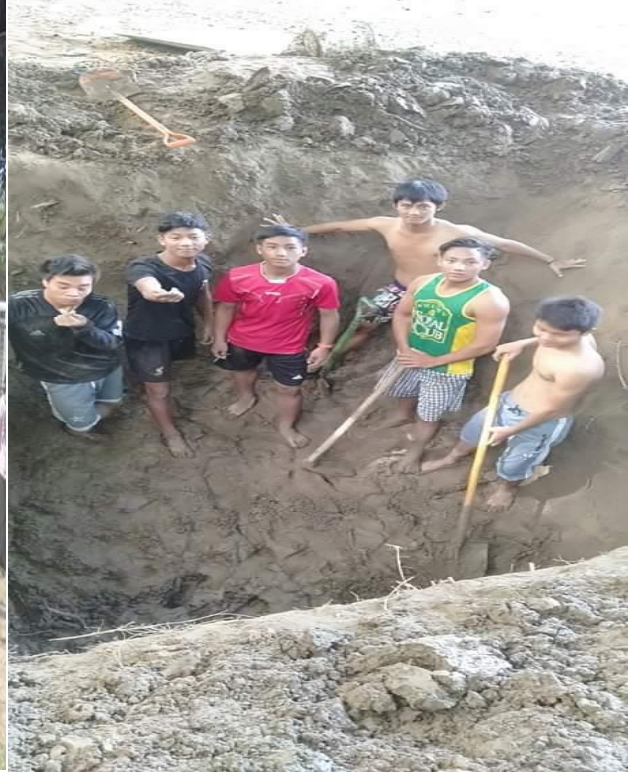
Working for sport place