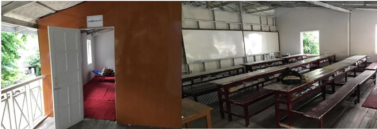
New class Room upstairs (1)