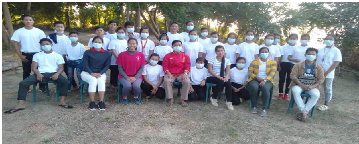
Dancing at Verena School opening at Mt. POPA