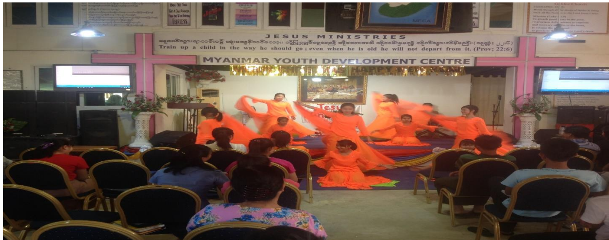
Christmas dancing in Yangon Church from Ferdi Home girls